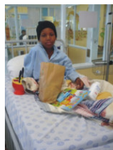
Goodie bags for those who had to stay behind.