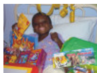
What a smile!